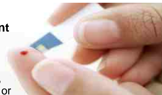
Type 2 Diabetes:

* The side effects are seen in a small percentage of persons using the medicine. The benefits of using the drug usually out-weigh the side-effects. Your doctor is the best person to decide the use and dosage of any drug.